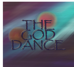
Book by David Shields, “The God Dance” May be published soon!