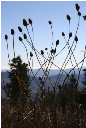
View from the Blue Ridge Parkway.

If you haven't gone to rescuedheart.com lately, I would like to invite you to check it out. I have redesigned the web site and given it a new look. I'm still working on some of the changes to its content, but have made style changes that I think you will like. Let me know what you think.