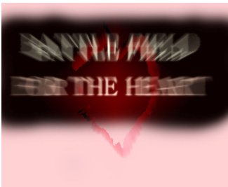
Battle Field For The Heart

How do we fight an enemy we can’t see? How do we distinguish our own voice from that of our enemy? How do we distinguish his voice from that of God? A study of 2 Corinthians 4:18 will help us find the answers to these difficult and often perplexing questions. “So we fix our eyes not on what is seen, but on what is unseen. For what is seen is temporary, but what is unseen is eternal.” (2 Corinthians 4:18 NIV)